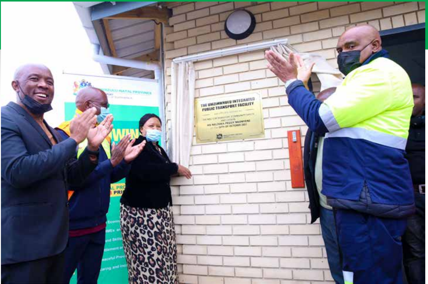
Umzimkhulu Intergrated Public Transport Facility.